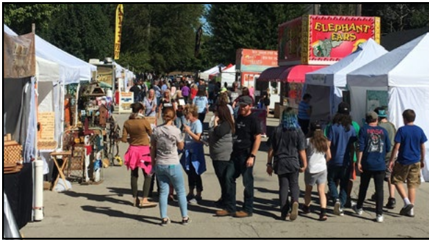
Reporter file photo