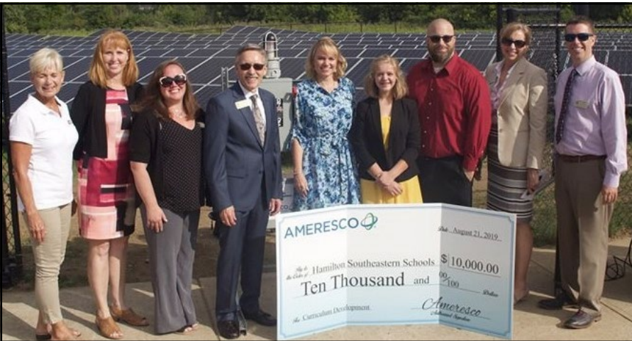
Last Wednesday, Hamilton Southeastern Intermediate & Junior High School (also known as “The HIJH”) held the “Flip the Switch” ceremony, marking the start of generating electricity for the school building through the solar arrays on the HIJH property. The HSE School Corporation entered into a contract with Ameresco Inc. in January of this year to install the $2.8 million solar project. The work is being financed by a four-year bond issue, which is not expected to trigger a tax increase.