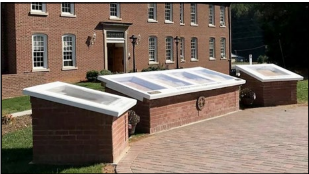
The Charters of Freedom display in Yancey County, N.C.