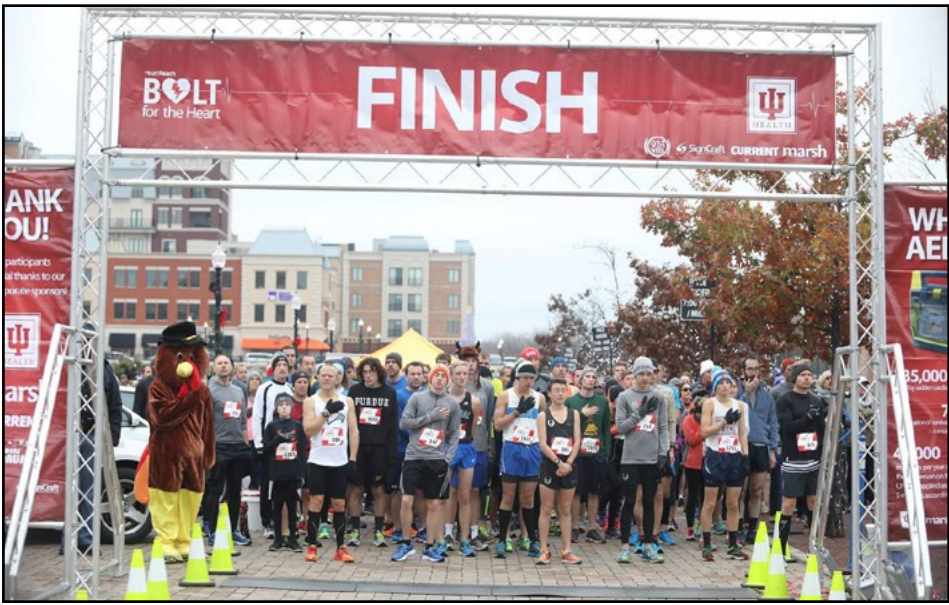
(Above) Since 2014, the goals of Bolt for the Heart have grown to include AED donations for use by first responders across the state of Indiana. (Below) Governor Eric Holcomb recognized BFTH last fall for the group’s success in getting an AED in every Indiana State Police vehicle.