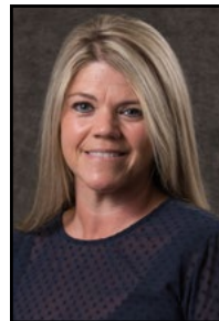
About Community First Bank