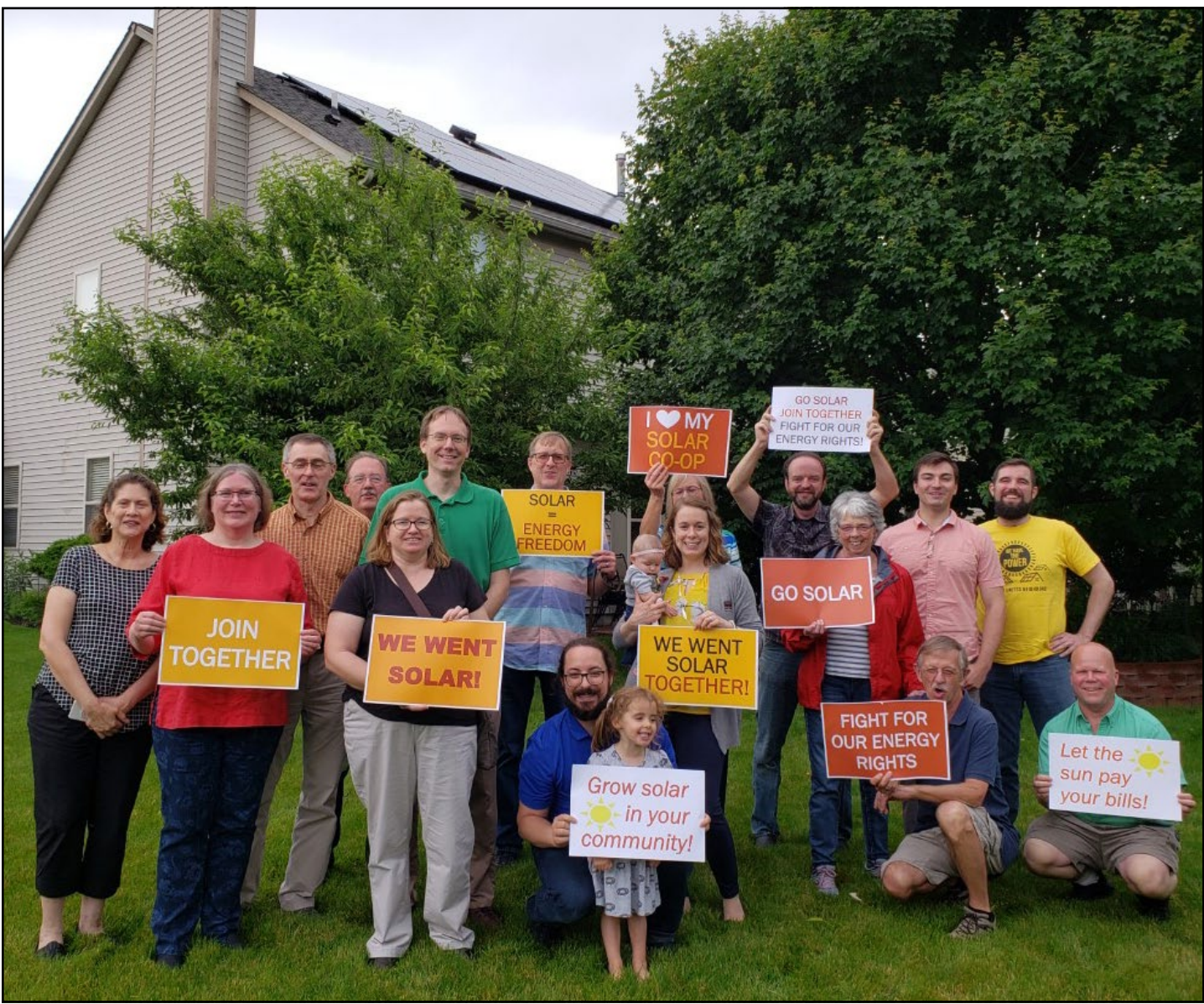
See Solar . . . Page 3 Homeowners who participated in the previous Solarize Hamilton County campaigns show their support at a solar home in Carmel.