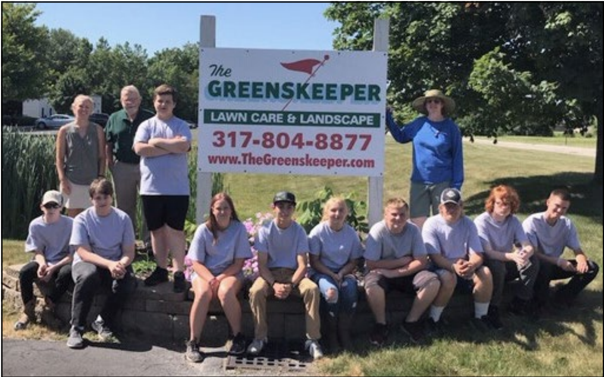
Ivy Tech Noblesville and Sheridan Youth Assistance recently partnered in a program that provided Sheridan area youth the opportunity to work, serve their community and learn what it takes for a business to be successful. Six area businesses participated in the event. Pictured are Sheridan students who worked with The Greenskeeper, a Westfield-based lawn care company.