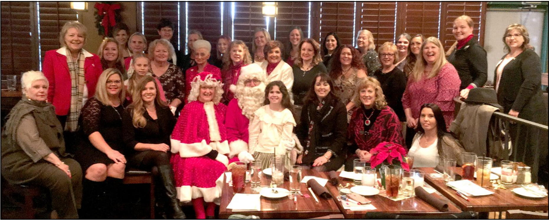
The Indiana Federation of Republican Women held its 2018 holiday celebration at Boulder Creek in Brownsburg Saturday afternoon. GOP women from across the state gathered for fellowship, to give thanks for personal and political events in 2018, to plan ahead for the national convention coming to Indiana next year, and to get into the spirit of the holidays. Everyone present signed several holiday cards to be sent to our troops serving in the military. Of course, Hamilton County had a strong presence at this event. More photos and information are available on Page 4 and at ReadTheReporter.com.