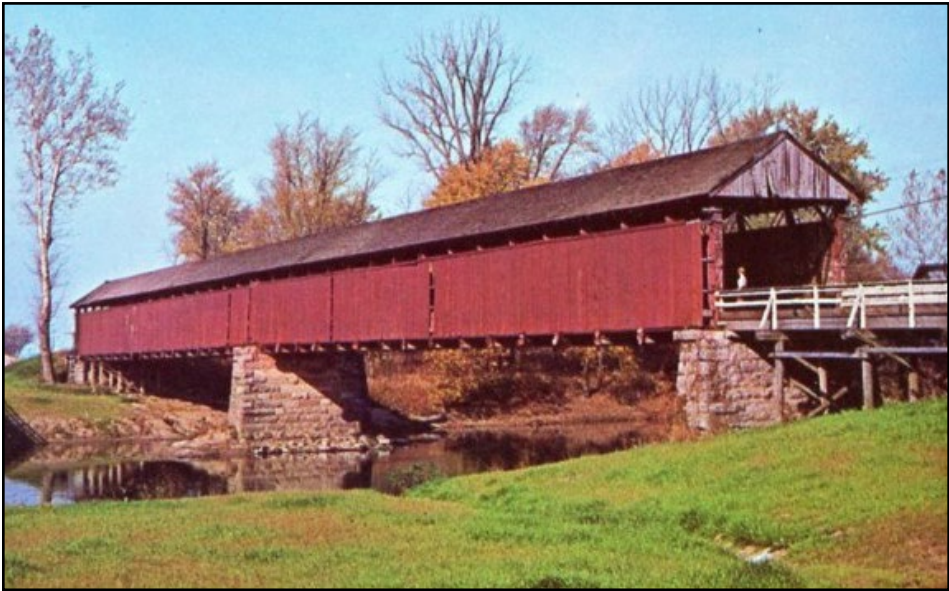
The Bell Ford Bridge was built in 1868 in Jackson County. It will be moved to Geist Park on Fall Creek to serve as the centerpiece for the park.