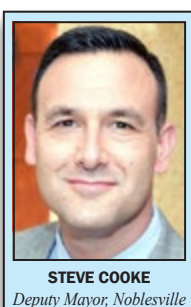
STEVE COOKE Deputy Mayor, Noblesville

Having worked for the City of Noblesville for nearly two years, I am continually impressed by the hard work and dedication of my fellow city employees. Some of them are well known for the work they do out-and-about in the community. But a vast majority are the unsung heroes who help make our great city the vibrant community that it is today.