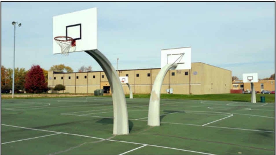
Artistic rendering provided