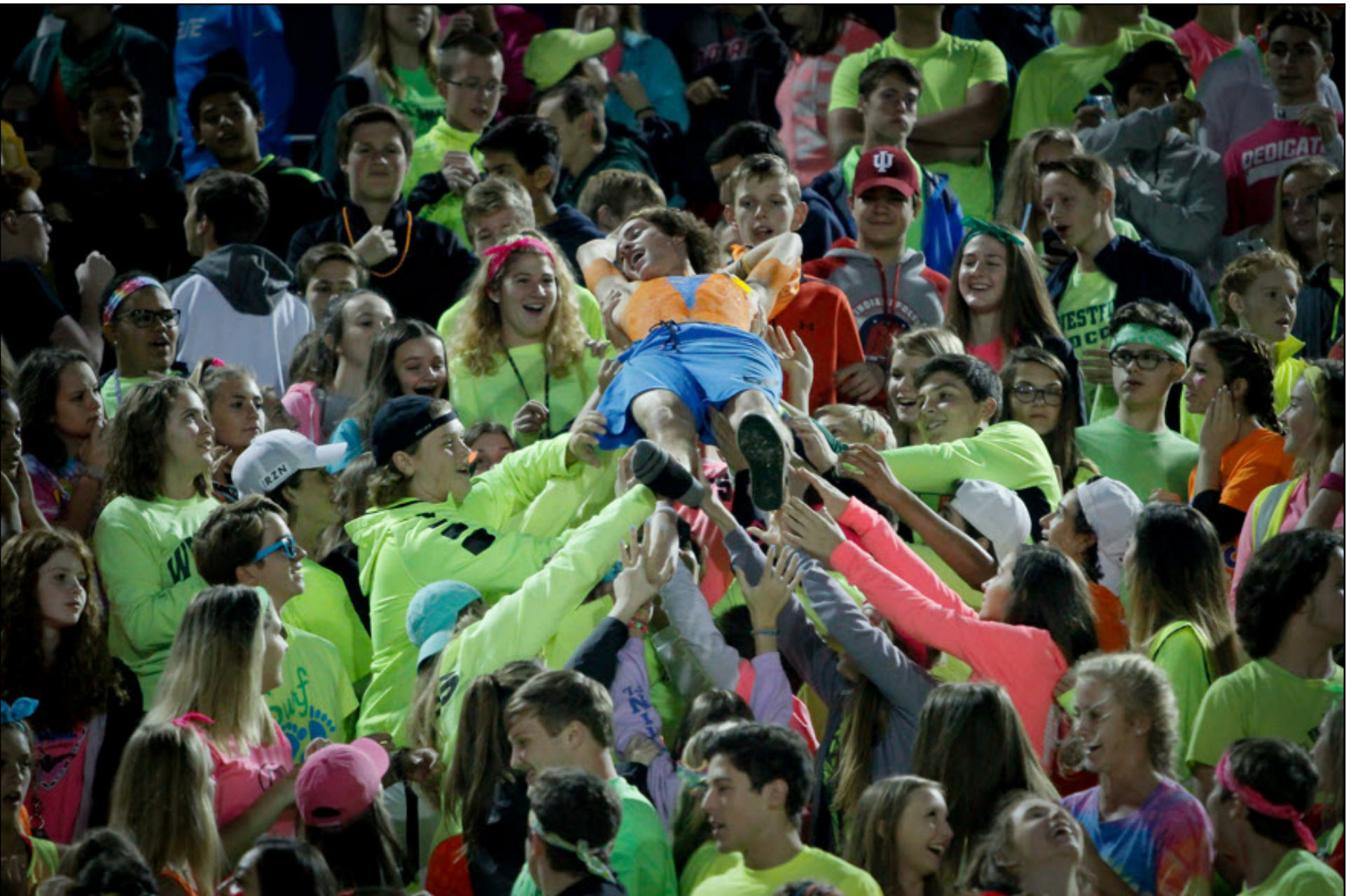
Homecoming fun at Westfield included a little bit of crowdsurfing.