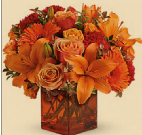
Teleflora's Sunrise Sunset

Everything you expect in a flower shop AND a whole lot more.