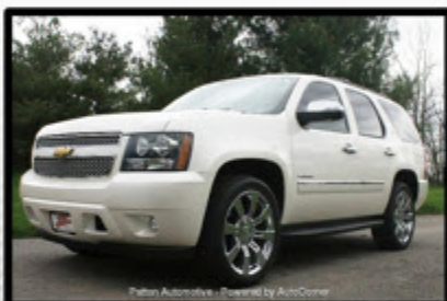
2010 Chevrolet Tahoe 86,043 miles $30,963