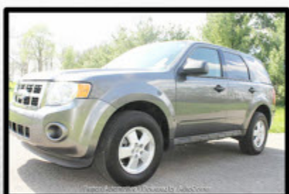
2012 Ford Escape 56,095 miles $13,743