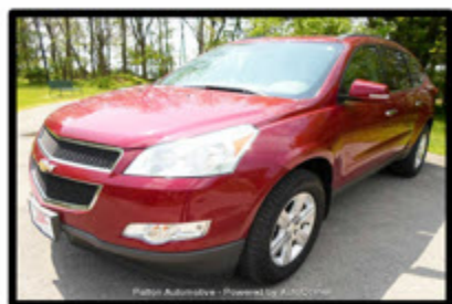
2010 Chevrolet Traverse 59,206 miles $18,823