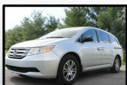
2013 Honda Odyssey 23,343 miles $29,551