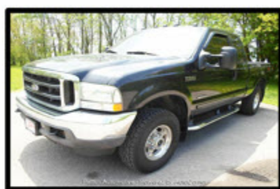
2003 Ford F-250 7.3L Diesel 131,031 miles $16,963