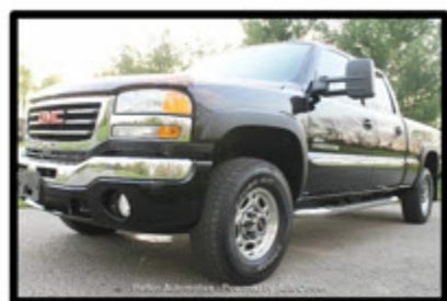
2006 GMC Sierra 2500HD Diesel 49,859 miles $31,763