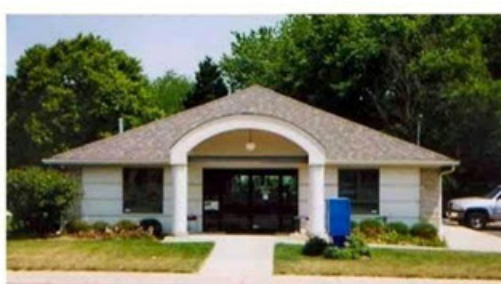
WESTFIELD 144 West Main Street

Also Serving Lapel, Summitville & Alexandria