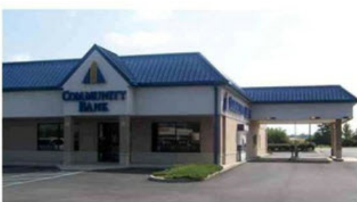
FISHERS 12514 Reynolds Drive (S.R. 37 & 126th Street)