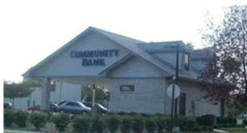
NOBLESVILLE 1007 South 10th Street