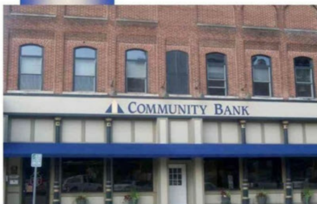
NOBLESVILLE 830 Logan Street

A Division of First Merchants Bank, N.A.