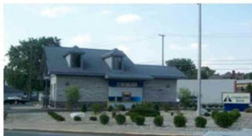
NOBLESVILLE 210 North 10th Street