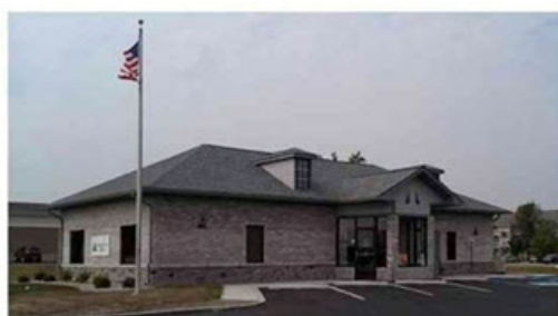
CICERO 1100 South Peru Street