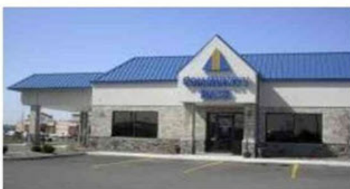
NOBLESVILLE 400 Noble Creek Drive