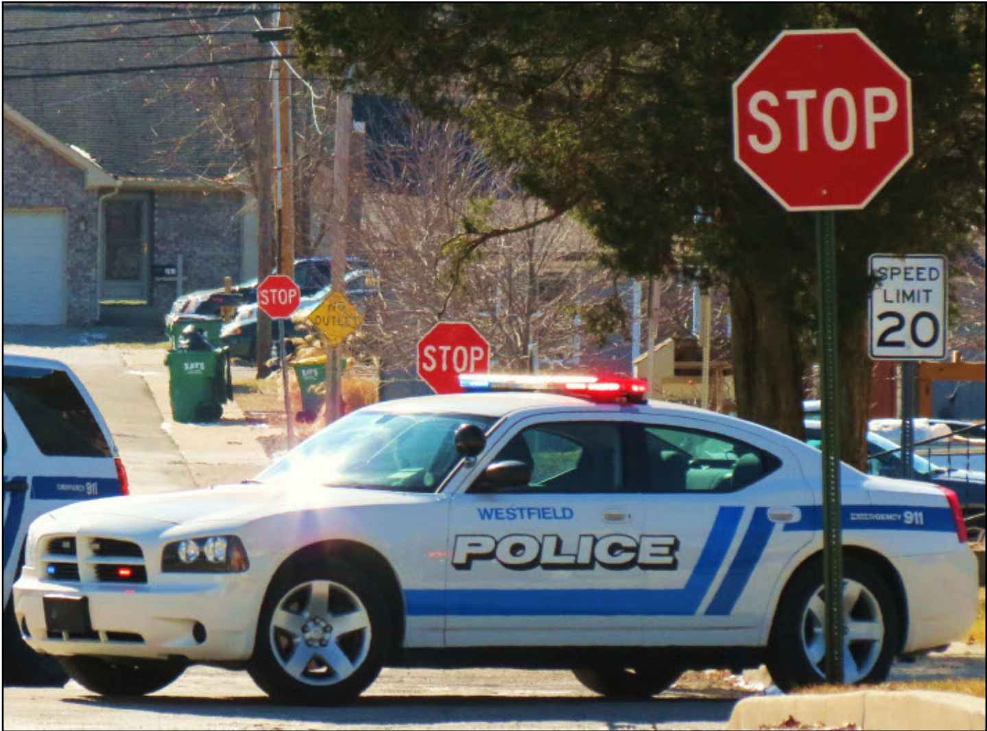
LEFT: Westfield Police are requesting anyone with information on either Friday's robbery, or a robbery to the Speedway gas station that took place earlier this week, to contact the Westfield Police Department at 317-804-3200. BOTTOM: Police patrol the area. Nearby Westfield High School, along with Westfield's Middle and Intermediate schools, were placed on lockdown.

Do You Have A Community Announcement? Wedding, Birth Announcement, Anniversary Share It With The Community Contact the Hamilton County Reporter information@hc- reporter.com or call 317-408-5548