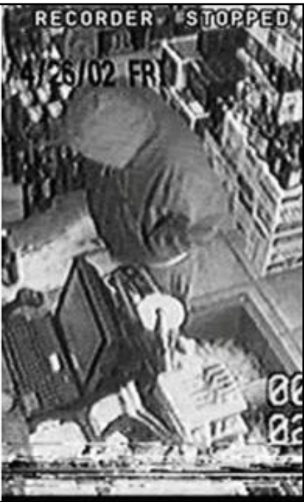
Photo provided ABOVE: These are security camera photos of the suspected robber. He is described as a white male, six feet tall, wearing a dark colored jacket and had a scarf covering his face.