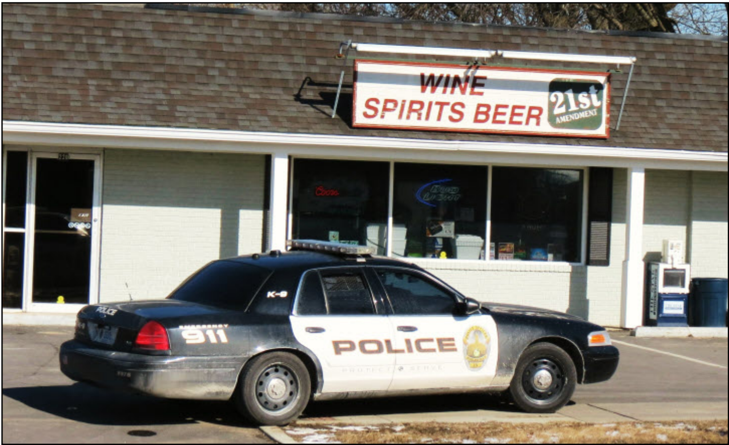
LEFT: Westfield Police are investigating a Friday morning robbery at the 21st Amendment liquor store, located at the 200 block of east Main Street in the city's downtown.