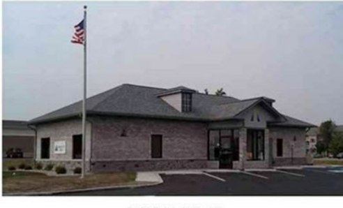
CICERO 1100 South Peru Street