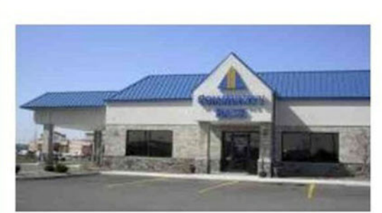
NOBLESVILLE 400 Noble Creek Drive