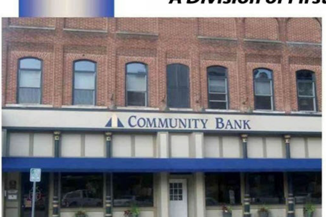
NOBLESVILLE 830 Logan Street