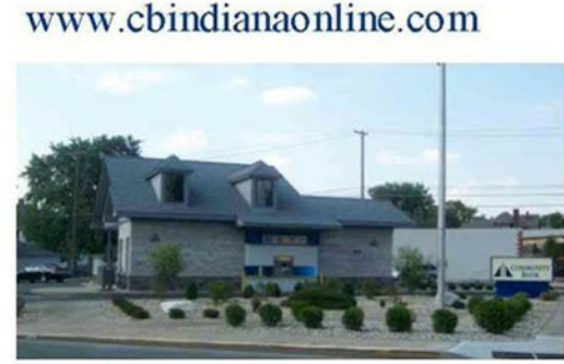
NOBLESVILLE 210 North 10th Street