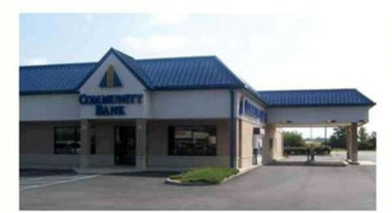
FISHERS 12514 Reynolds Drive (S.R. 37 & 126th Street)