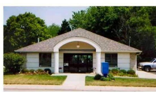
WESTFIELD 144 West Main Street

Also Serving Lapel, Summitville & Alexandria