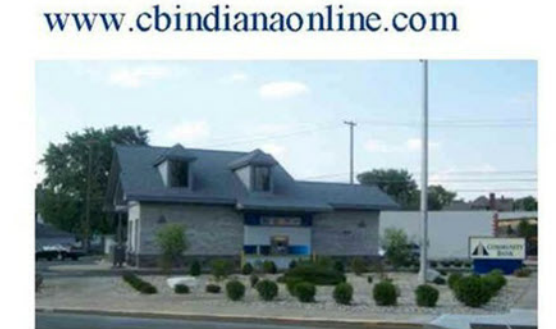
NOBLESVILLE 210 North 10th Street