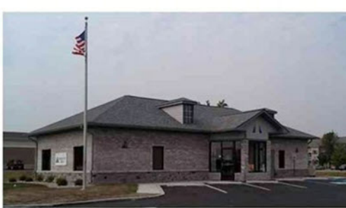
CICERO 1100 South Peru Street