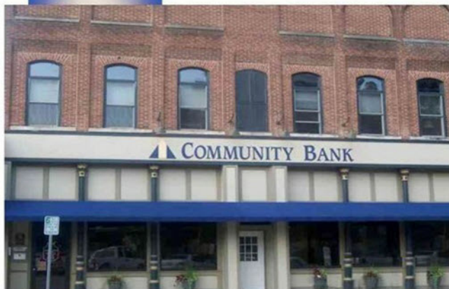
NOBLESVILLE 830 Logan Street

A Division of First Merchants Bank, N.A.