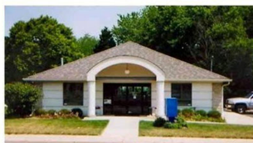
WESTFIELD 144 West Main Street

Also Serving Lapel, Summitville & Alexandria