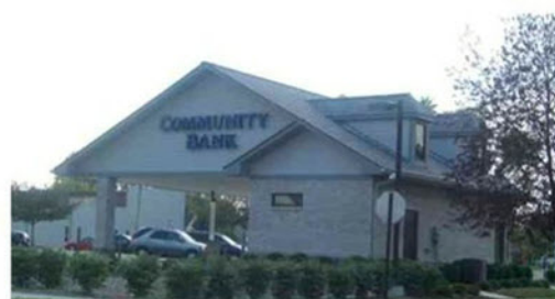
NOBLESVILLE 1007 South 10th Street