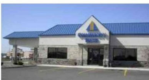
NOBLESVILLE 400 Noble Creek Drive