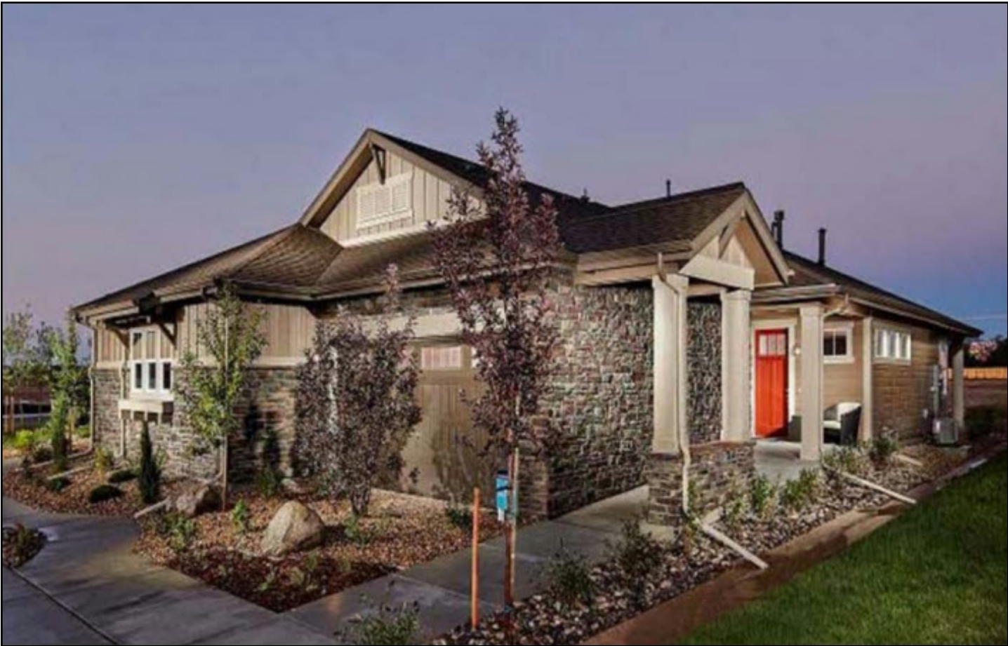
Artistic rendering submitted

The city council also introduced multi-ple new ordinances dealing with proposed new housing subdivisions. The develop-ments’ fates could be decided at upcoming council meetings. The first proposed development would be south of Guerin Catholic High School and northeast of the intersection of 146 th Street and Gray Road. Holston Hills would potentially bring 127 new homes to a 58 acre site. The neigh-borhood would feature minimal community improvements and be marketed toward empty-nesters. The second proposed development the city is considering approving would be lo-cated south of Sagamore Golf Club on the east side of Union Chapel Road. The proposed Chapel Villas calls for 56 new homes on 14.5 acres north of Green-field Ave. The next city council meeting will be conducted at 7 p.m., Tuesday, Feb. 10 at Noblesville City Hall. Ditslear said he is supportive of the new developments as long as they are of a high quality and meet the city’s standards. “I think this is a sign that people have confidence in Noblesville. Without new homes, then you’re not going to get a Scotty’s Brewhouse,” he said. Scotty’s has recently announced plans to open a new location in the former Mud-socks Grill space at Hazel Dell and 146 th Street, he said.