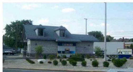
NOBLESVILLE 210 North 10th Street