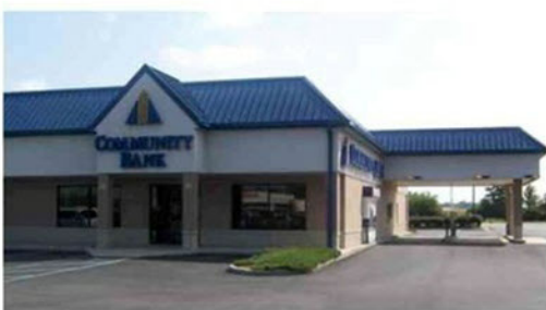
FISHERS 12514 Reynolds Drive (S.R. 37 & 126th Street)