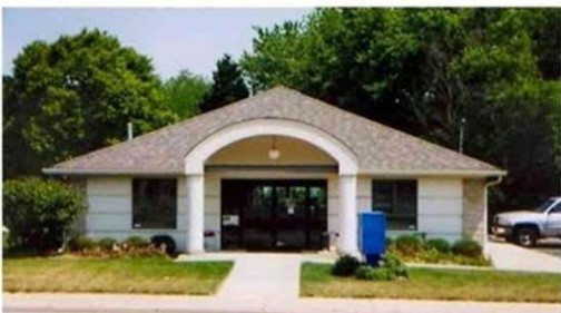
WESTFIELD 144 West Main Street