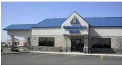
NOBLESVILLE 400 Noble Creek Drive