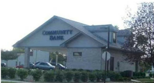
NOBLESVILLE 1007 South 10th Street