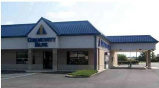
FISHERS 12514 Reynolds Drive (S.R. 37 & 126th Street)