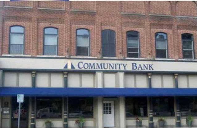
NOBLESVILLE 830 Logan Street