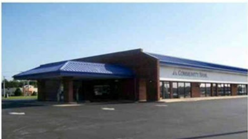
NOBLESVILLE 651 Westfield Road