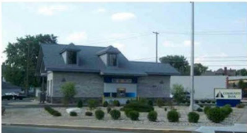
NOBLESVILLE 210 North 10th Street