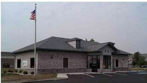
CICERO 1100 South Peru Street