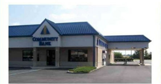
FISHERS 12514 Reynolds Drive (S.R. 37 & 126th Street)