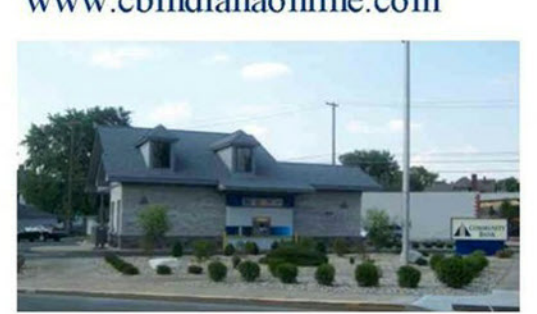
NOBLESVILLE 210 North 10th Street