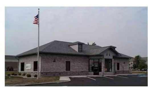
CICERO 1100 South Peru Street