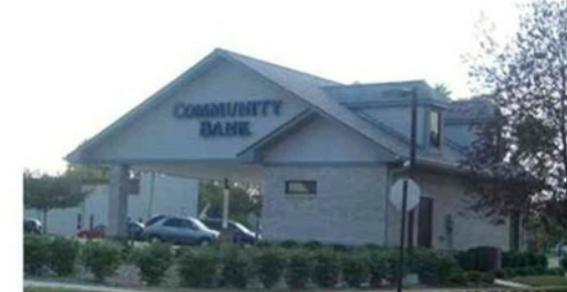
NOBLESVILLE 1007 South 10th Street