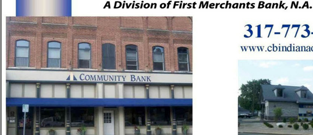
NOBLESVILLE 830 Logan Street