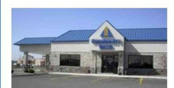
NOBLESVILLE 400 Noble Creek Drive