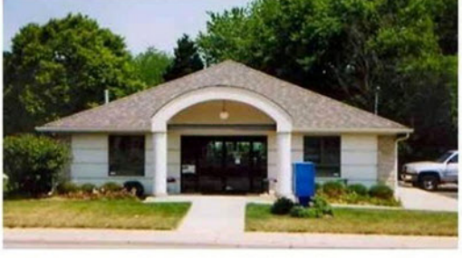
WESTFIELD 144 West Main Street