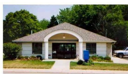
WESTFIELD 144 West Main Street

Also Serving Lapel, Summitville & Alexandria