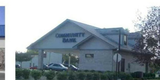
NOBLESVILLE 1007 South 10th Street