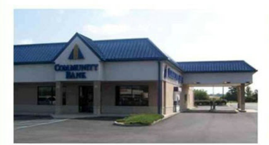
FISHERS 12514 Reynolds Drive (S.R. 37 & 126th Street)