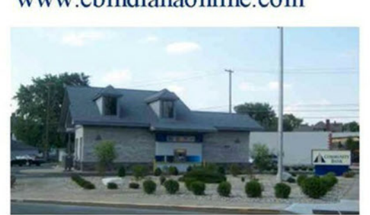
NOBLESVILLE 210 North 10th Street