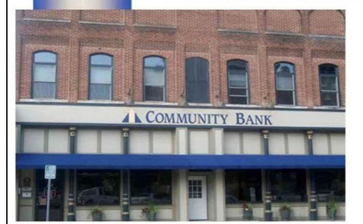
NOBLESVILLE 830 Logan Street

A Division of First Merchants Bank, N.A.