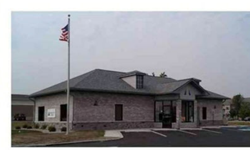
CICERO 1100 South Peru Street