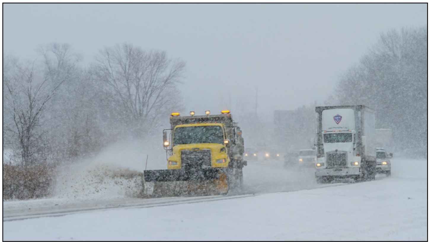
An INDOT truck plows the snowy road on State Road 37.

Wind chill values near minus 25 degrees mean that frostbite is possible within 15 minutes. During extreme temperatures make sure you have adequate shelter for pets and check on the elderly to make sure they have sufficient heat, food and water. Temperatures are expected to stay below freezing through the weekend.