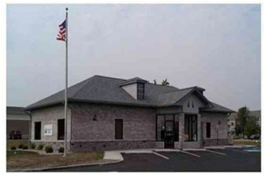
CICERO 1100 South Peru Street