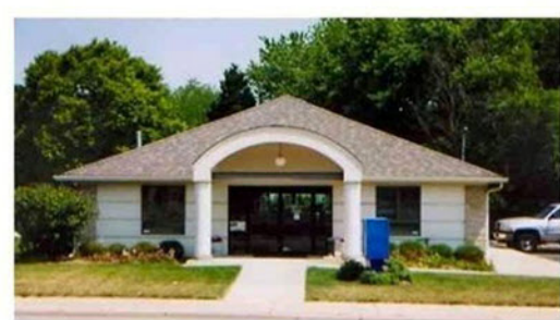
WESTFIELD 144 West Main Street

Also Serving Lapel, Summitville & Alexandria FDIC