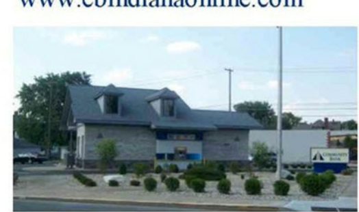
NOBLESVILLE 210 North 10th Street