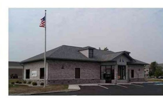
CICERO 1100 South Peru Street