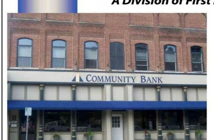
NOBLESVILLE 830 Logan Street