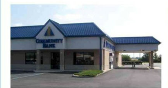
FISHERS 12514 Reynolds Drive (S.R. 37 & 126th Street)