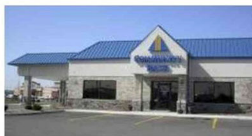
NOBLESVILLE 400 Noble Creek Drive