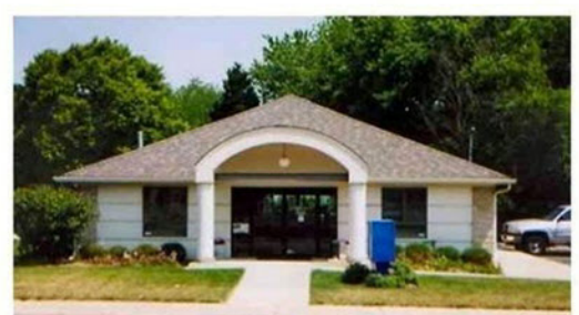
WESTFIELD 144 West Main Street

Also Serving Lapel, Summitville & Alexandria