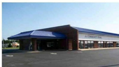
NOBLESVILLE 651 Westfield Road