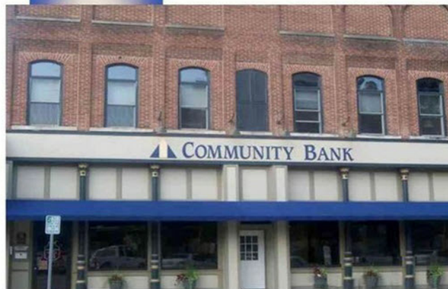
NOBLESVILLE 830 Logan Street

A Division of First Merchants Bank, N.A.