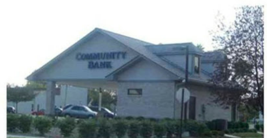
NOBLESVILLE 1007 South 10th Street