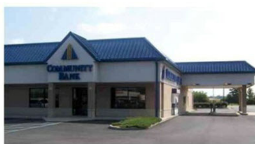
FISHERS 12514 Reynolds Drive (S.R. 37 & 126th Street)