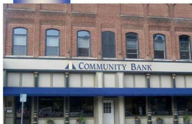
NOBLESVILLE 830 Logan Street

A Division of First Merchants Bank, N.A.