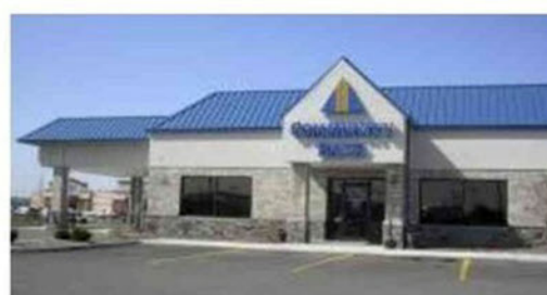
NOBLESVILLE 400 Noble Creek Drive