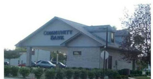
NOBLESVILLE 1007 South 10th Street