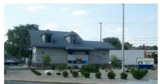
NOBLESVILLE 210 North 10th Street