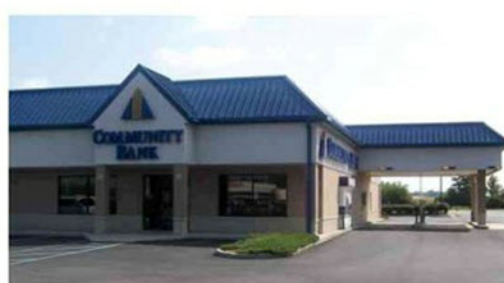
FISHERS 12514 Reynolds Drive (S.R. 37 & 126th Street)