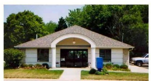
WESTFIELD 144 West Main Street

Also Serving Lapel, Summitville & Alexandria