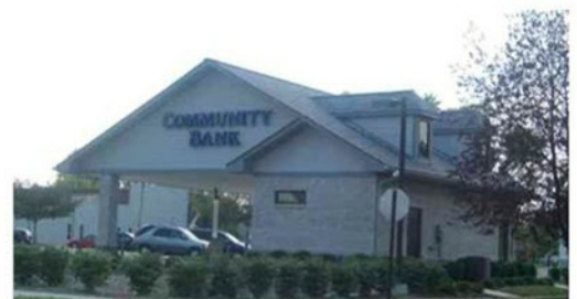
NOBLESVILLE 1007 South 10th Street