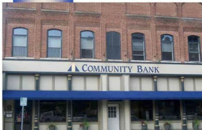
NOBLESVILLE 830 Logan Street

A Division of First Merchants Bank, N.A.