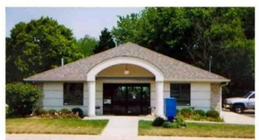
WESTFIELD 144 West Main Street

Also Serving Lapel, Summitville & Alexandria Member FDIC