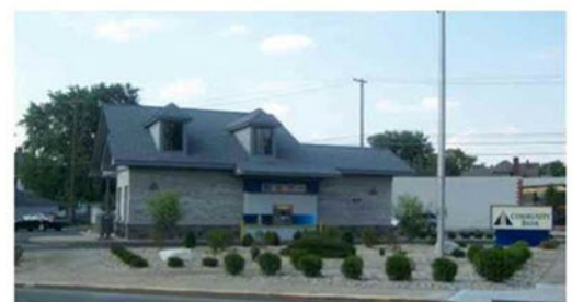
NOBLESVILLE 210 North 10th Street