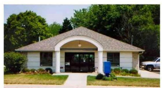
WESTFIELD 144 West Main Street

Also Serving Lapel, Summitville & Alexandria Member FDIC