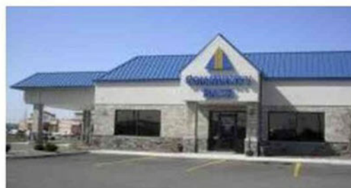
NOBLESVILLE 400 Noble Creek Drive