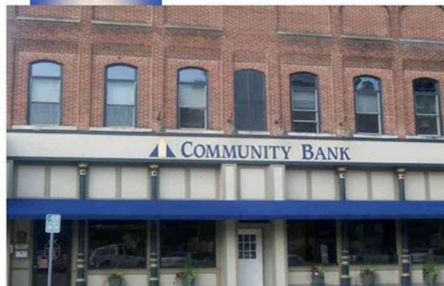
NOBLESVILLE 830 Logan Street