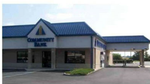
FISHERS 12514 Reynolds Drive (S.R. 37 & 126th Street)