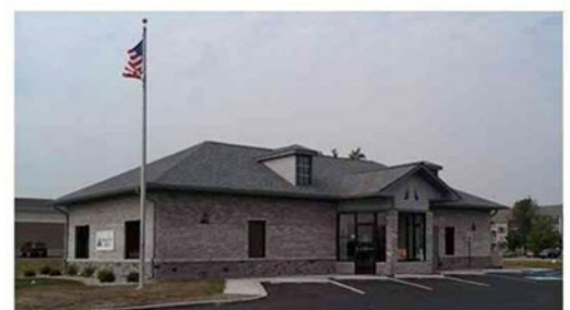
CICERO 1100 South Peru Street