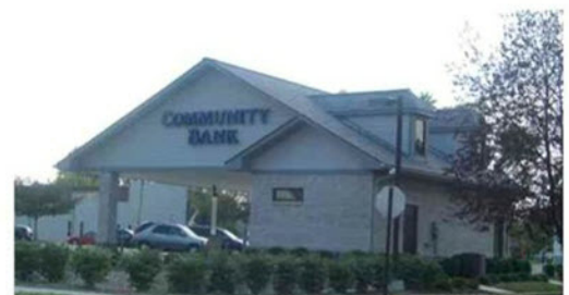
NOBLESVILLE 1007 South 10th Street