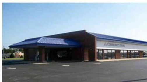
NOBLESVILLE 651 Westfield Road