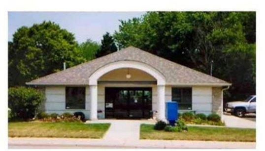
WESTFIELD 144 West Main Street