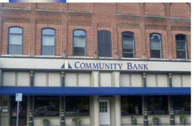
NOBLESVILLE 830 Logan Street