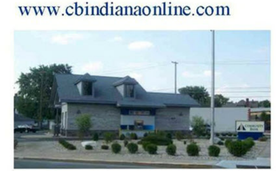
NOBLESVILLE 210 North 10th Street