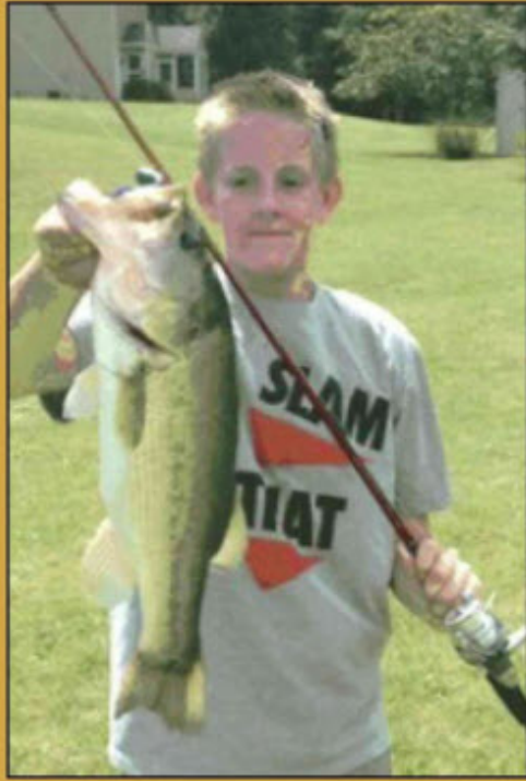
Week 9 Carter Ball