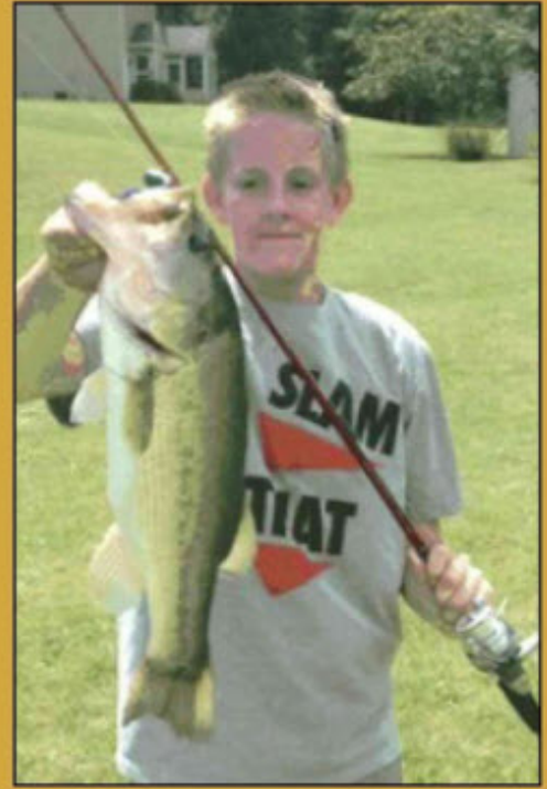
Week 9 Carter Ball