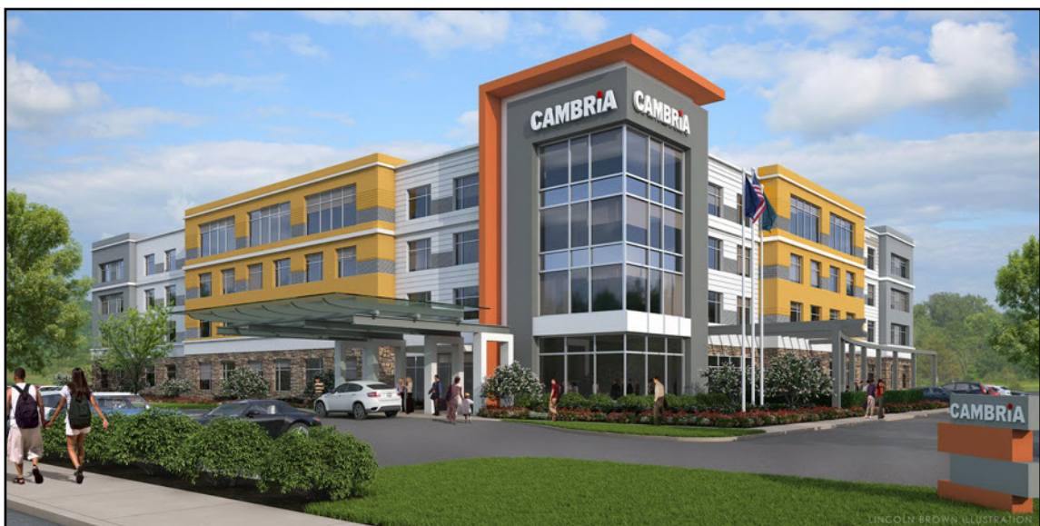
Lincoln Brown illustration

Grand Park has exceeded its first year projections with 870,000 visits since opening in March. In addition to the already strong tournament attendance, Grand Park will now attract year-round sporting events. Private developers have already committed to build two indoor facilities: a $24 million soccer/lacrosse/football facility to open in 2015 and a $6 million basketball/volleyball facility.