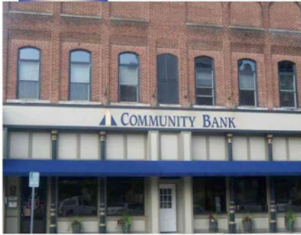
NOBLESVILLE 830 Logan Street