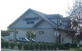
NOBLESVILLE 1007 South 10th Street