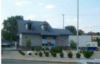
NOBLESVILLE 210 North 10th Street