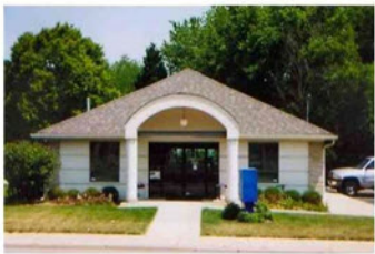
WESTFIELD 144 West Main Street

Also Serving Lapel, Summitville & Alexandria