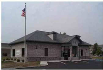
CICERO 1100 South Peru Street