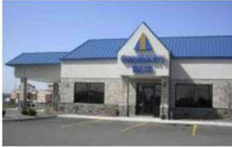
NOBLESVILLE 400 Noble Creek Drive