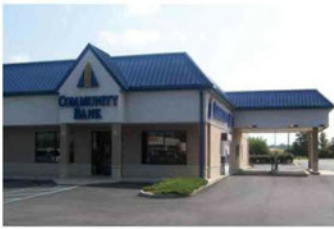
FISHERS 12514 Reynolds Drive (S.R. 37 & 126th Street)