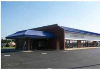
NOBLESVILLE 651 Westfield Road