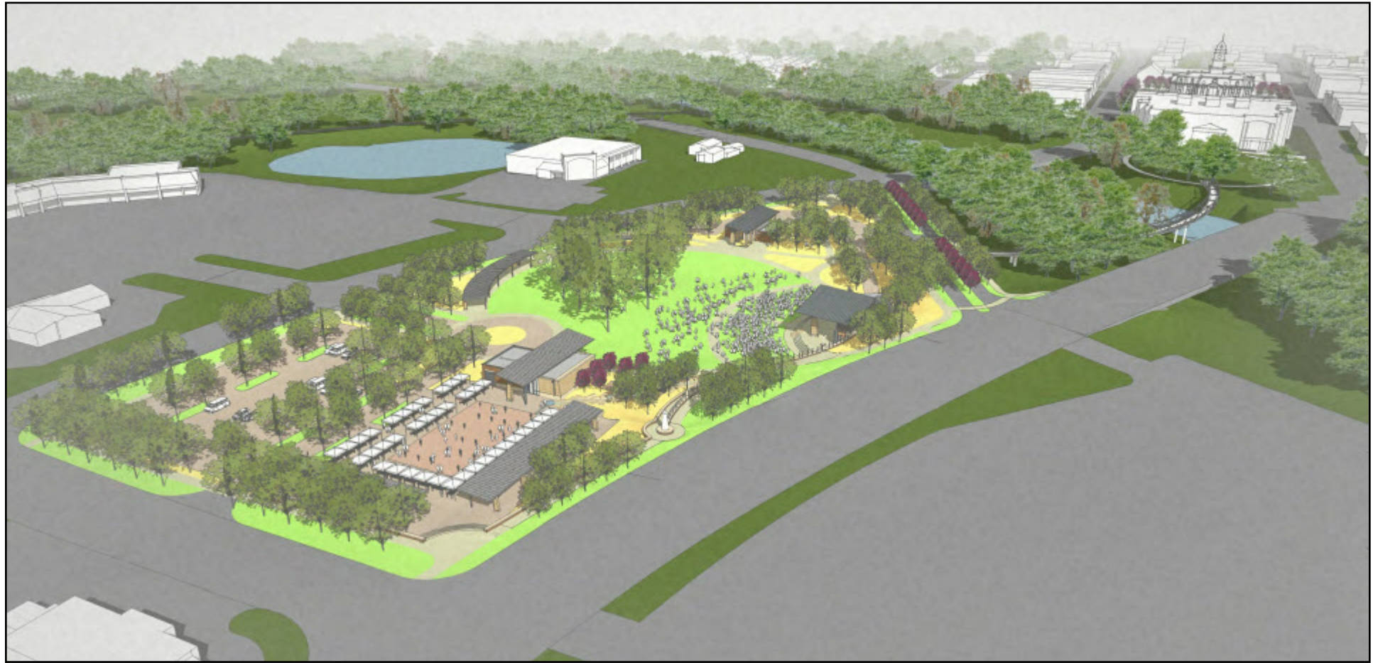
Artistic rendering provided

Above is a sketch of the Federal Hill Park. It covers everything, east to west; north to south. Please center in on the bridge over White River in the right corner of the sketch. In the meeting earlier this week, folks learned that the $3 million bridge has been pulled from the budget. Question: does this kill the "connection" between downtown Noblesville and Federal Hill Park, which always has appeared to be very important to the City? Option: Overflow of visitors for a concert, etc. who have parked downtown or in the county parking lot on Conner Street would have to use the very narrow sidewalk on the Conner Street Bridge, which closely borders the most traveled highway in the city. Or, the Logan Street Bridge. Or, if you like to hike, the railroad bridge which feeds into Forest Park The very expensive bridge pulled from the project, it appears to the Reporter, should have more of a discussion. After all, what is $3 million dollars in today's world? Or, we might wonder, how about a causeway, such as the one recently built over the reservoir connecting east Cicero and west Cicero? Might be cheaper?