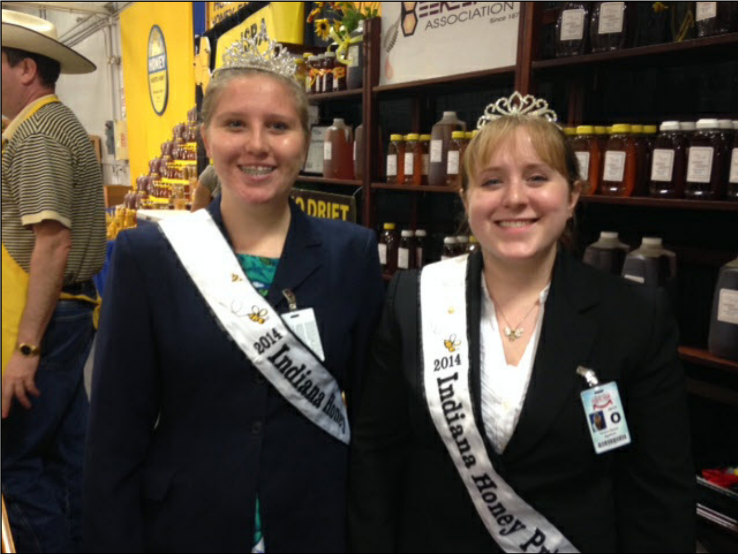
at the Fair