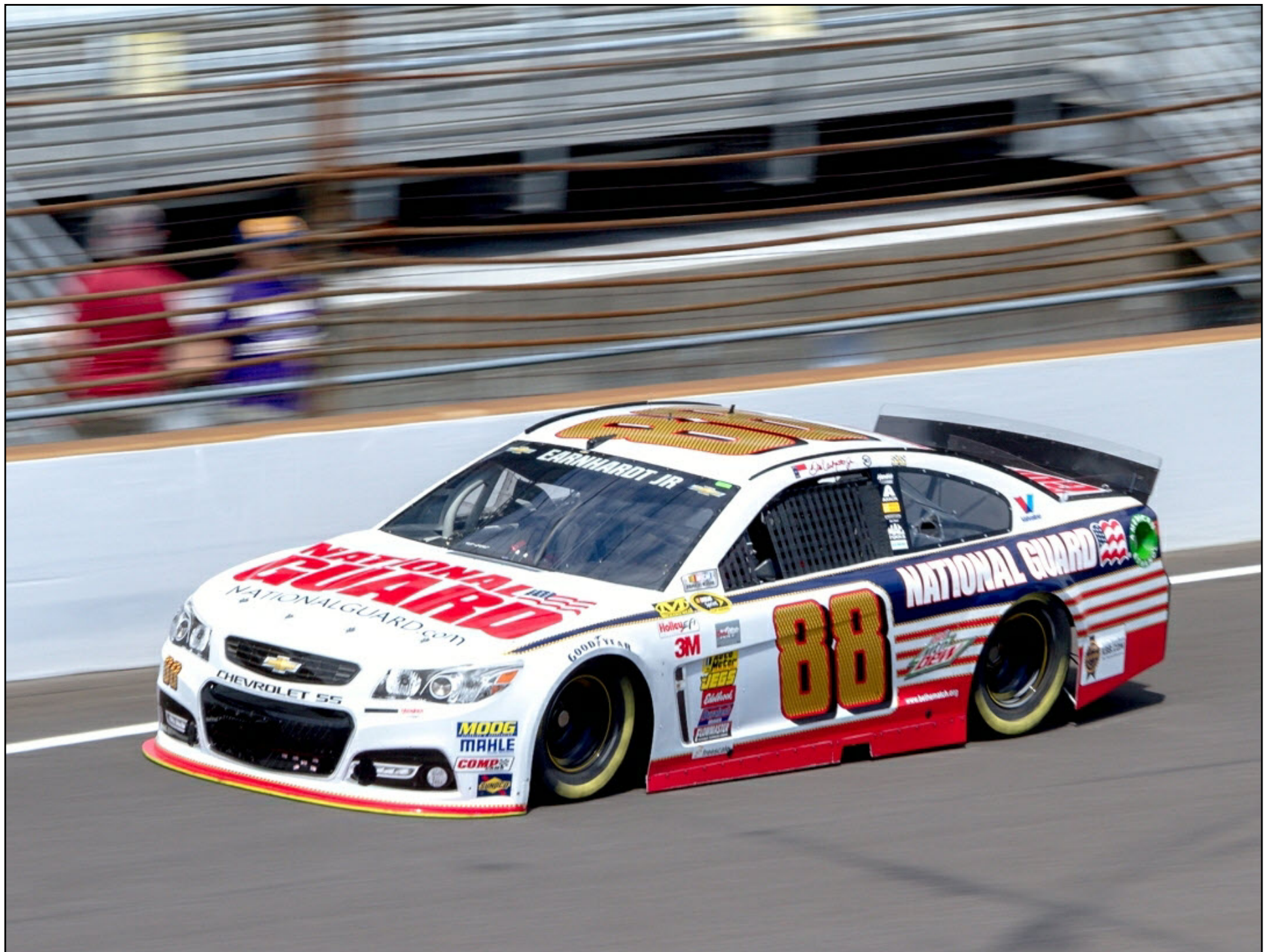
Dale Earnhardt Jr. turned in some practice laps on Friday for this year's Crown Royals presents the John Wayne Walding 400 at the Brickyard. Earnhardt will start 23rd in today's race.

Other notables in the starting line-up include defending champion Ryan Newman in fourth, two-time champion Tony Stewart in sixth, Johnson in 11th. Fan favorites looking for their first wins are Danica Patrick in 14th, Carl Edwards in 20th and Dale Earnhardt Jr. in 23rd. Bobby Labonte will start 43rd out of 43; he is the 2000 winner.