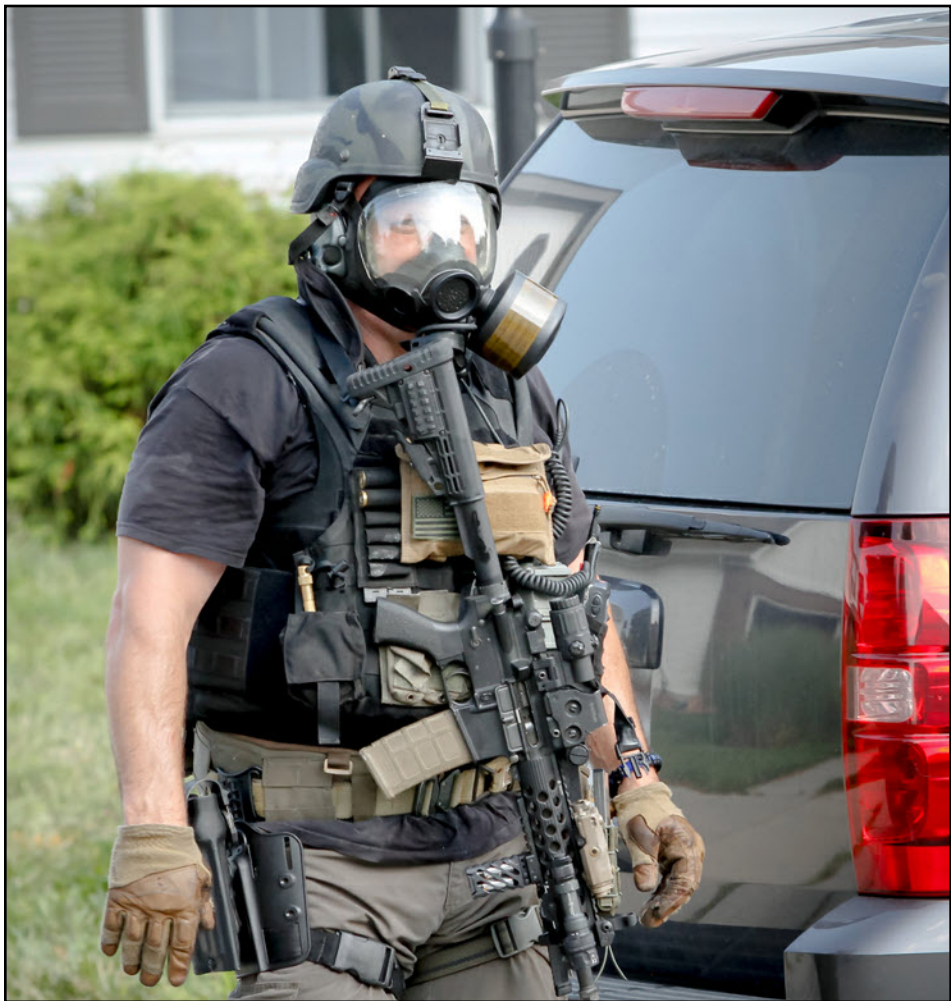
Left - Fishers Police ESU masked up for tear gas deployment