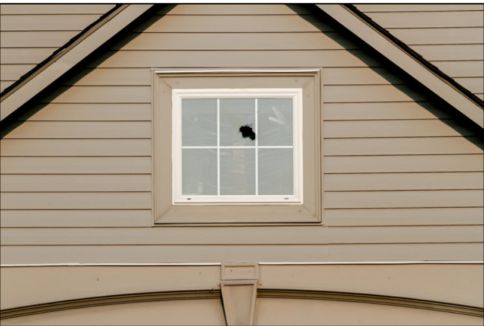
Below - A hole in the window of the alleged gunman's house from tear gas deployment