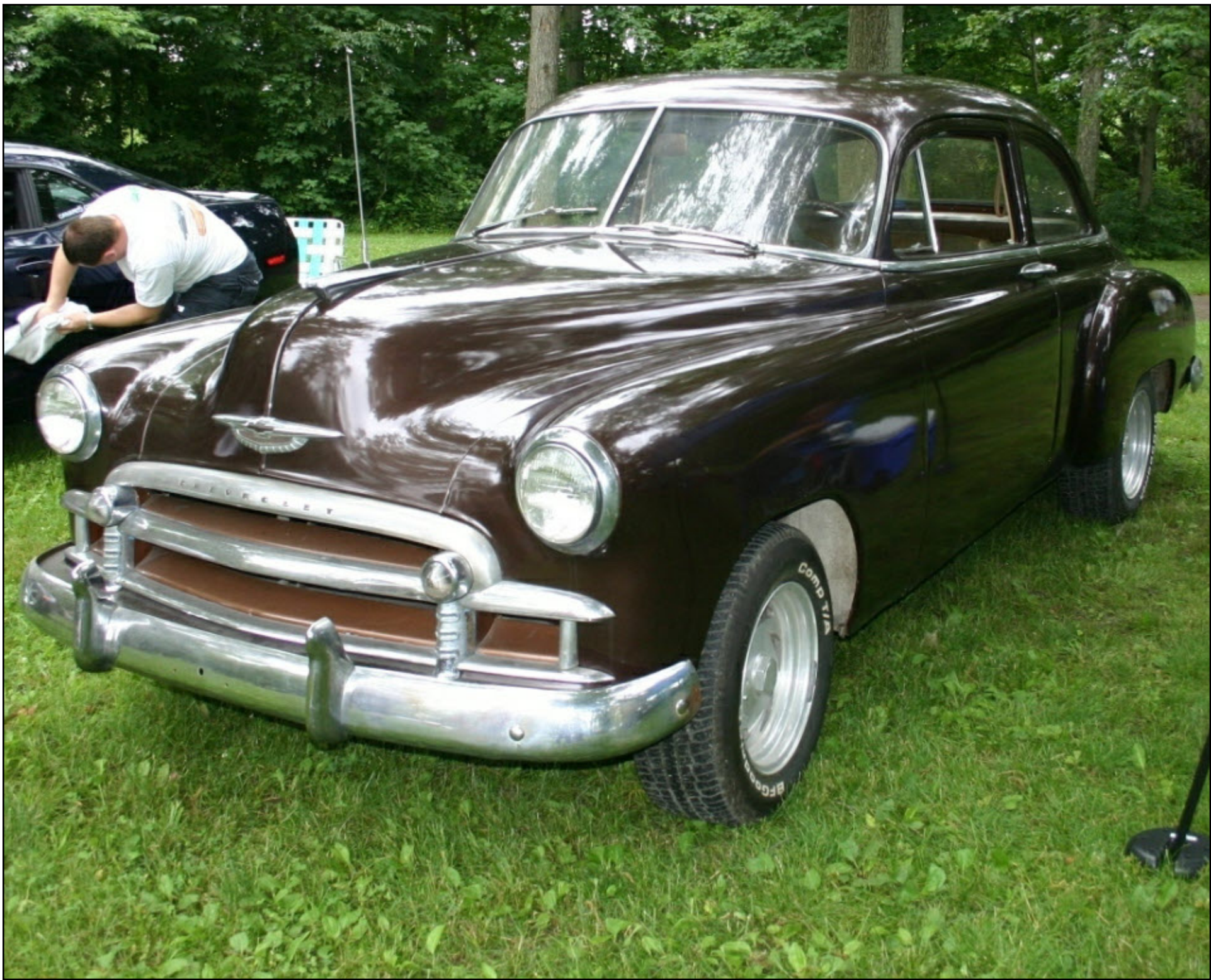
Photos provided Cars of all models will be on display on Father's Day at the car show at Forest Park. Central Indiana Vintage Vehicles is sponsoring the event.