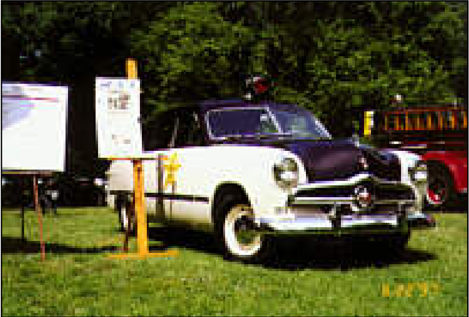
Central Indiana Vintage Vehicles restored this 1950 Ford as a Hamilton County Sheriff's car. The group will sponsor a car show on Father's Day at Forest Park.