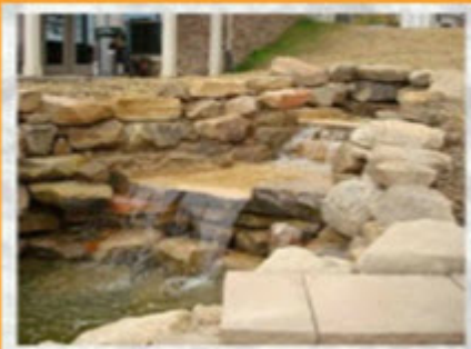
Full Landscaping and Hardscape Services