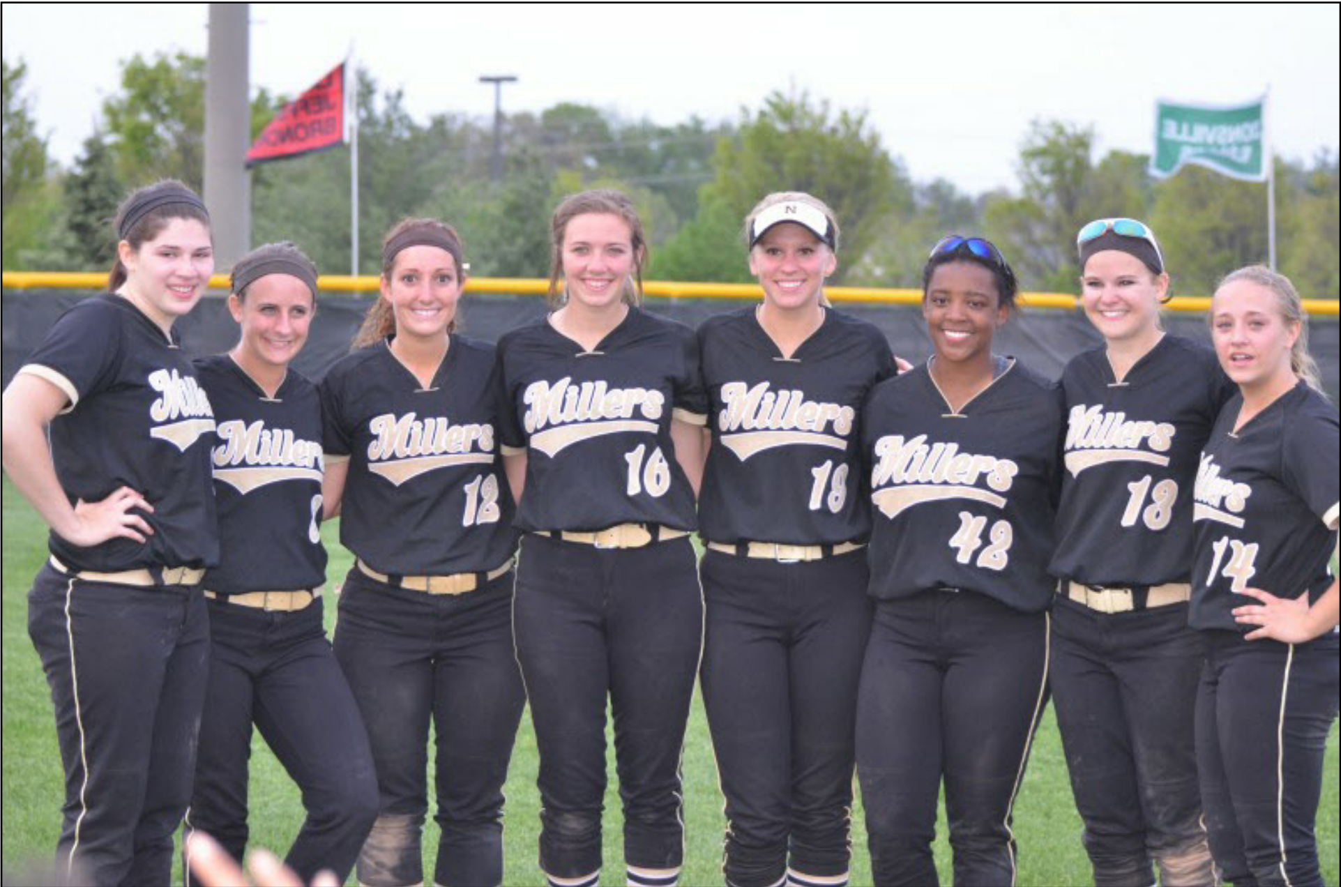
Reporter