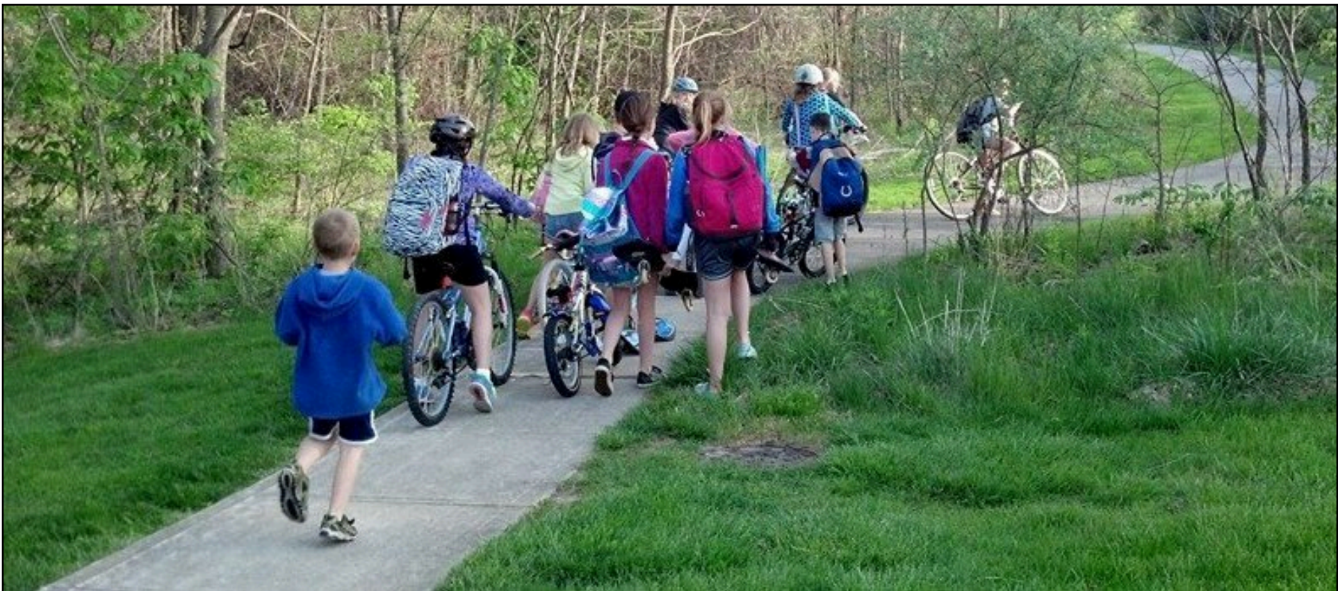
Students from Hazel Dell Elementary School participated in National Bike to School Day on Wednesday. The students and their parents walked or rode on the trail from Hazel Dell subdivision to the school.