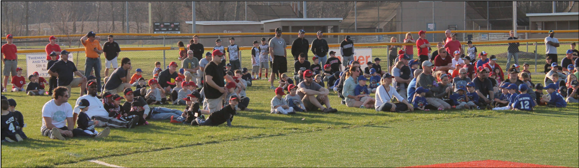
Noblesville Youth Baseball conducted its opening ceremonies for the 2014 season Friday evening at the Bobby Mills Field of Dreams. Pictured are several of the teams that will be playing in tournaments over the spring and summer.