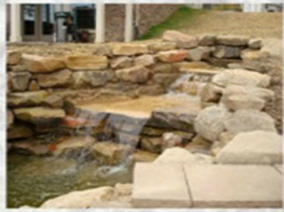
Full Landscaping and Hardscape Services