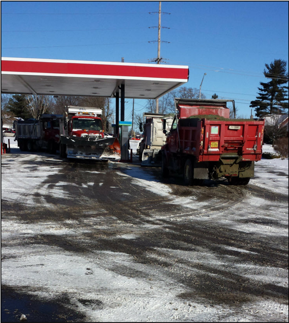
Hamilton County's salt trucks line up for fuel at the Country Mark gas station. The county was placed under a Level 1 Travel Advisory on Tuesday after that morning's snow.