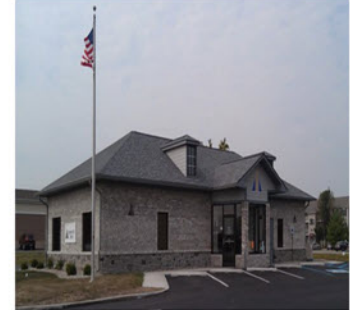
CICERO 1100 South Peru Street