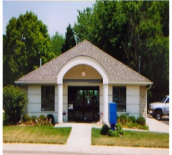
WESTFIELD 144 West Main Street

FISHERS 12514 Reynolds Drive (S.R. 37 & 126th Street)