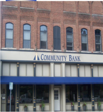
NOBLESVILLE 830 Logan Street