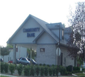
NOBLESVILLE 1007 South 10th Street