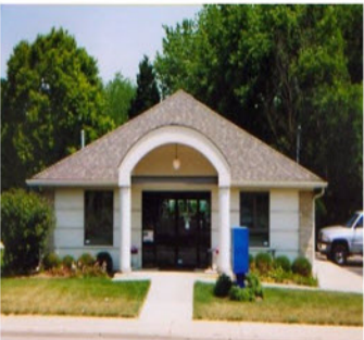
WESTFIELD 144 West Main Street

Also Serving Lapel, Summitville & Alexandria