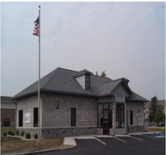
CICERO 1100 South Peru Street