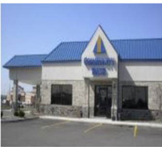
NOBLESVILLE 400 Noble Creek Drive