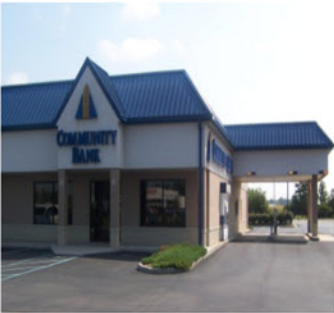
FISHERS 12514 Reynolds Drive (S.R. 37 & 126th Street)