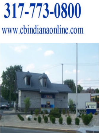
317-773-0800 www.cbindianaonline.com NOBLESVILLE 210 North 10th Street