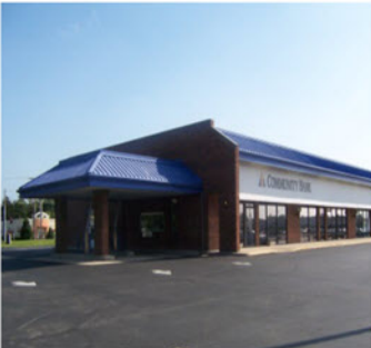
NOBLESVILLE 651 Westfield Road