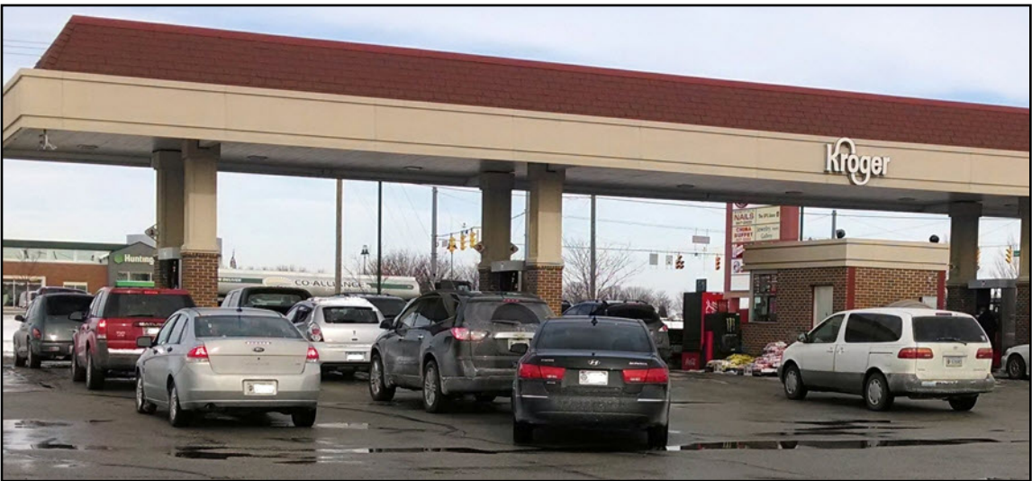
Gas station lines were long all across the county, including at the Kroger's station in Westfield. Drivers are recommended to keep their tanks full to prevent gas lines from freezing.

If you are a current print edition subscriber, as of December 30, you will receive in the mail a letter providing you with special instructions on how to receive the Hamilton County Reporter's online/email edition free of charge.