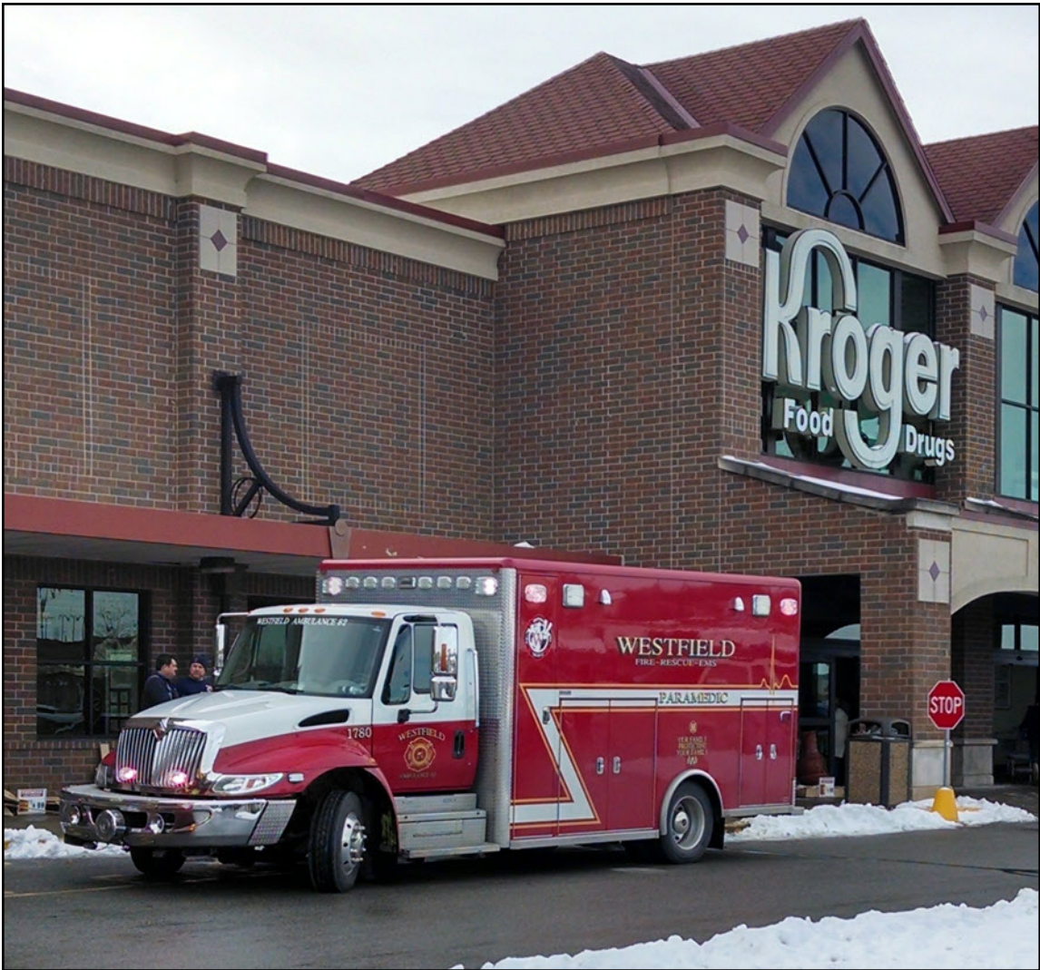
Westfield Fire and paramedics responded to Kroger located at State Rd. 32 and Carey Rd. in Westfield to assist a shopper that became ill.

especially in rural areas of the county. Along with this, temperatures will fall to subzero levels not seen in many years.