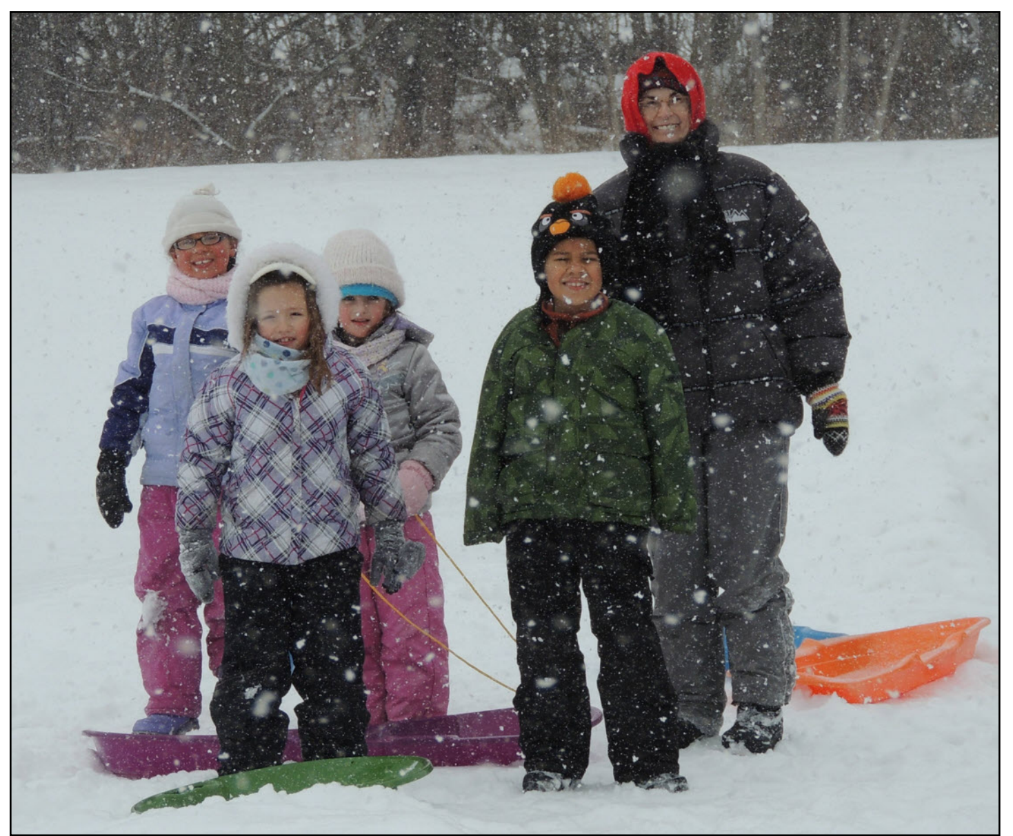
LEFT: Despite the heavy snow falling and blowing all around them, this intrepid Sheridan family enjoyed sledding down the embankment behind the Sheridan Public Library.